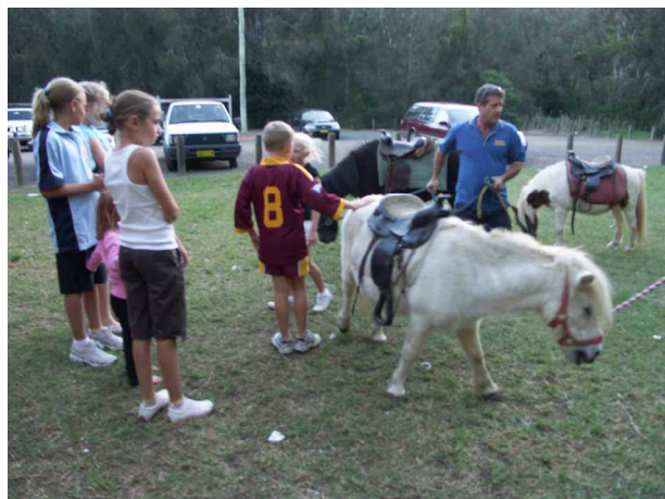
Scenes from our "2007 season opener" festivities last Saturday.

Coaching clinic for Junior players - Monday 9 July Junior Presentation - Sunday 21 October A & C Grade presentation - Friday 26 October Senior Presentation - Saturday 27 October Annual General Meeting - Thursday 22 November